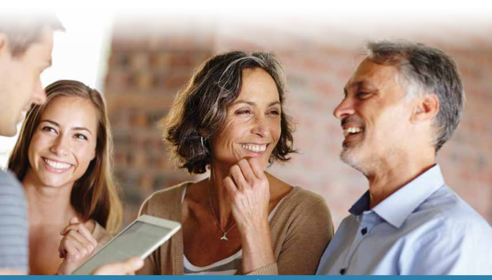
Page 14 of 20

<u>Election</u>: In most states, you will have fifteen days following the receipt of the accelerated benefit election form to accept our offer of an accelerated benefit payment. You will be under no obligation to accept this offer.